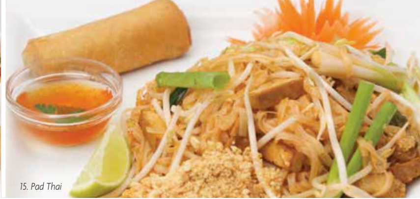
15. Pad Thai