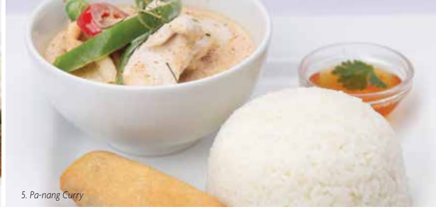
5. Pa-nang Curry