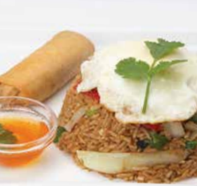
20. Thai Corner Special Fried Rice