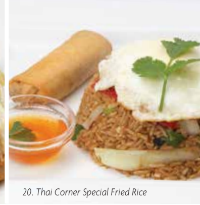
20. Thai Corner Special Fried Rice