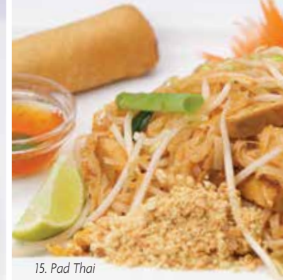
15. Pad Thai