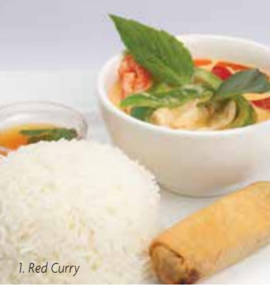
1. Red Curry